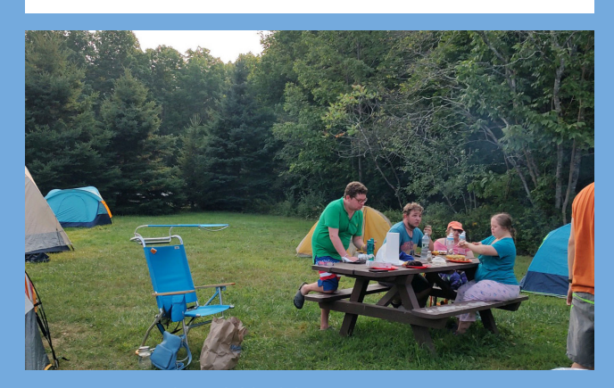
Residents dubbed their tents "Apart-tents.

After tents were set up and supper prepared, everyone sat around the campfire and made s'mores. In the morning a yummy breakfast was shared amid stories of the owl that was heard in the night. The trip was a huge success, and everybody is ready to try two nights next year. Lamoine State Park's group camping site is a treasure!!