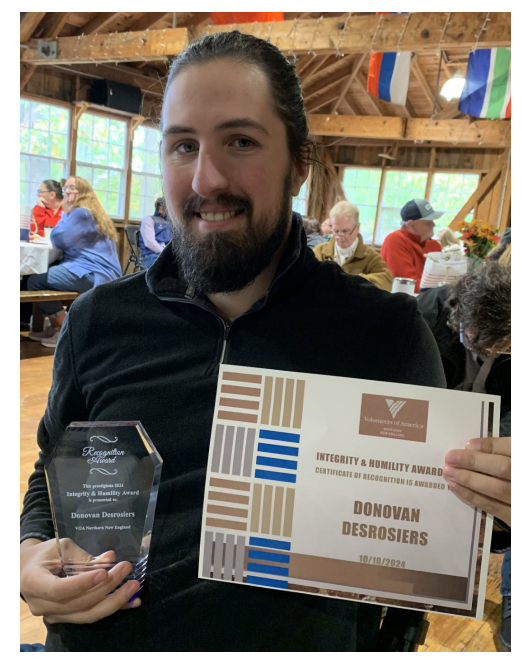
(Note: Volunteers of America - VOA - is the organization that staffs the Parish House).